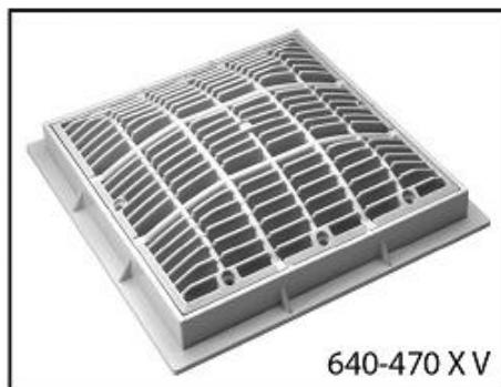
640-470 X V