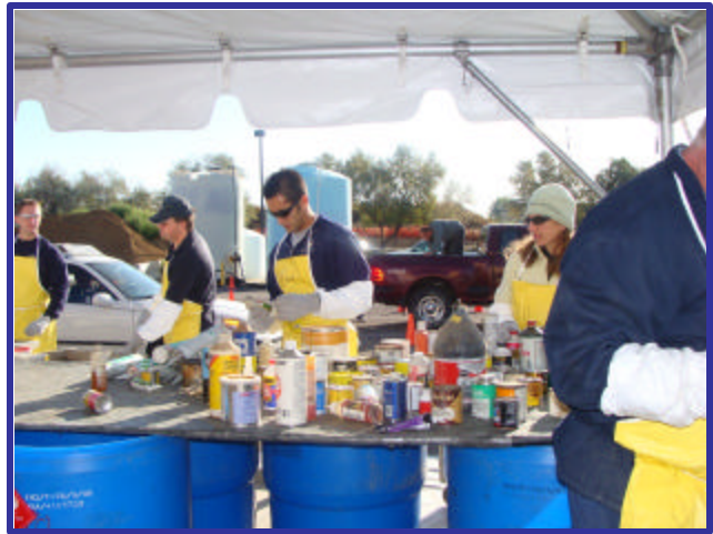
Household Hazardous Waste Day workers separate waste delivered by residents on Oct. 3.

Registered RV users can continue using the City of Westminster's RV Waste Dump Station, free of