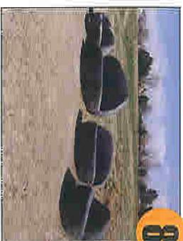
8 ..... Basking Boulders Artist, Gary Hauschulz Materials: Basalt Located at Sunset Ridge