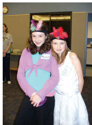
Right: TAB members at the Flapper Flashback dance program

Are you interested in volunteering at the library? You can take care of some of your community service hours by joining the Teen Advisory Board (TAB).