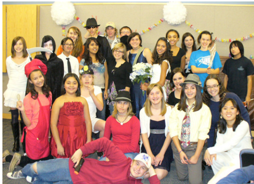
TAB members at the 2011 Murder Mystery Dinner.

Are you interested in volunteering at the library? You can take care of some of your community service hours by joining the Teen Advisory Board (TAB).